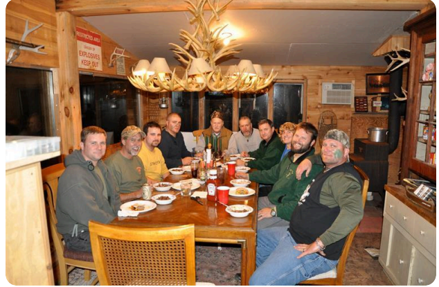
Supper Time at the Cajun Cottage