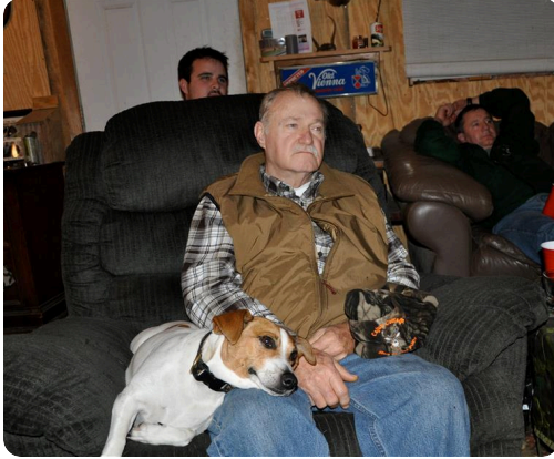
R&R at the EZ Cajun Cottage